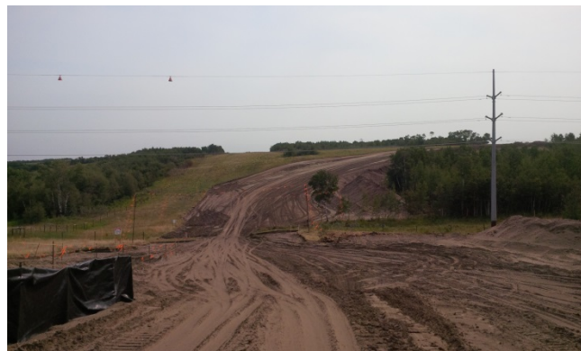
4. At Km 2+300 looking east at the ROW – Aug 17, 2017