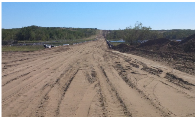
3. At Km 1 looking east at the ROW – Aug 17, 2017