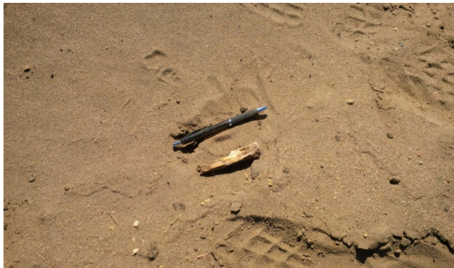
1. Bone found at Km 1+500 – Aug 17, 2017