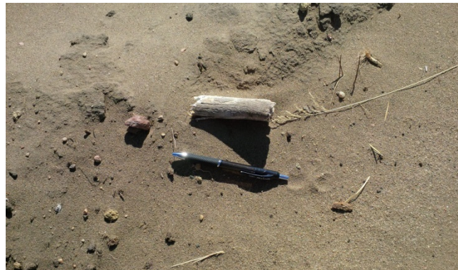
2. Bone found at Km 1+500 – Aug 17, 2017